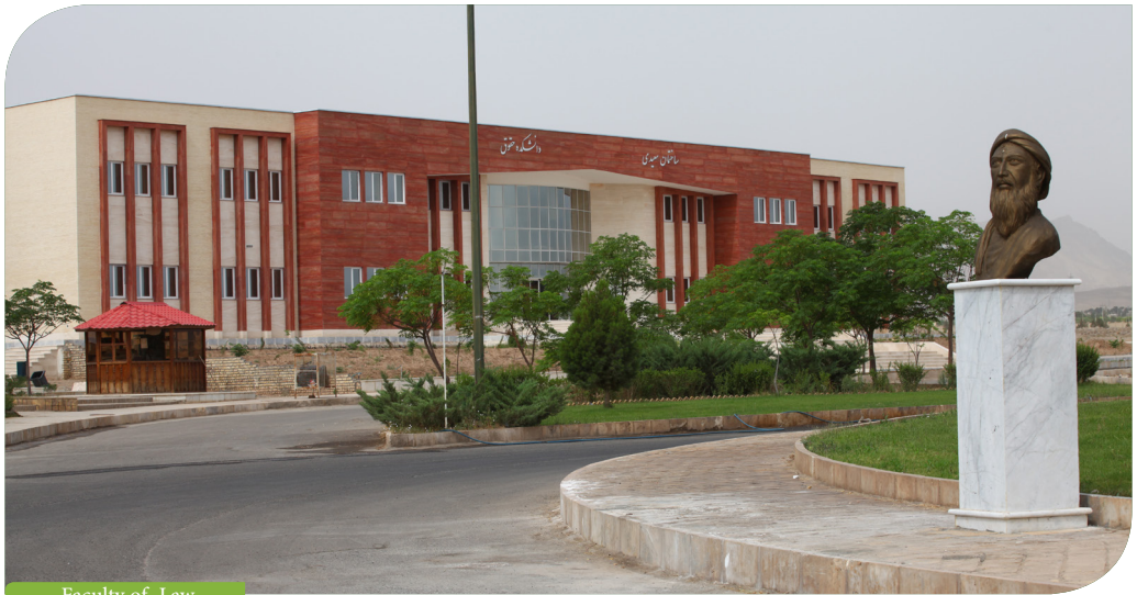
Faculty of Law