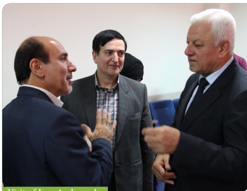
Visit of Iraq Ambassador