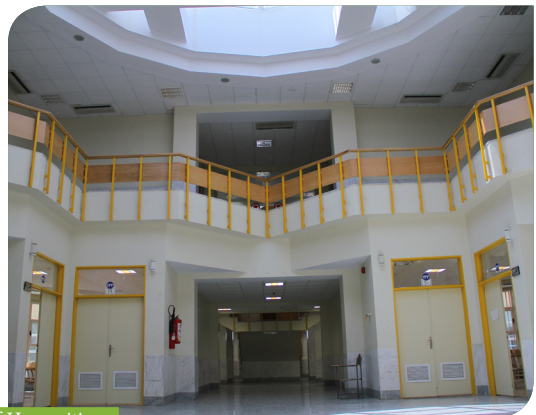
Faculty of Humanities