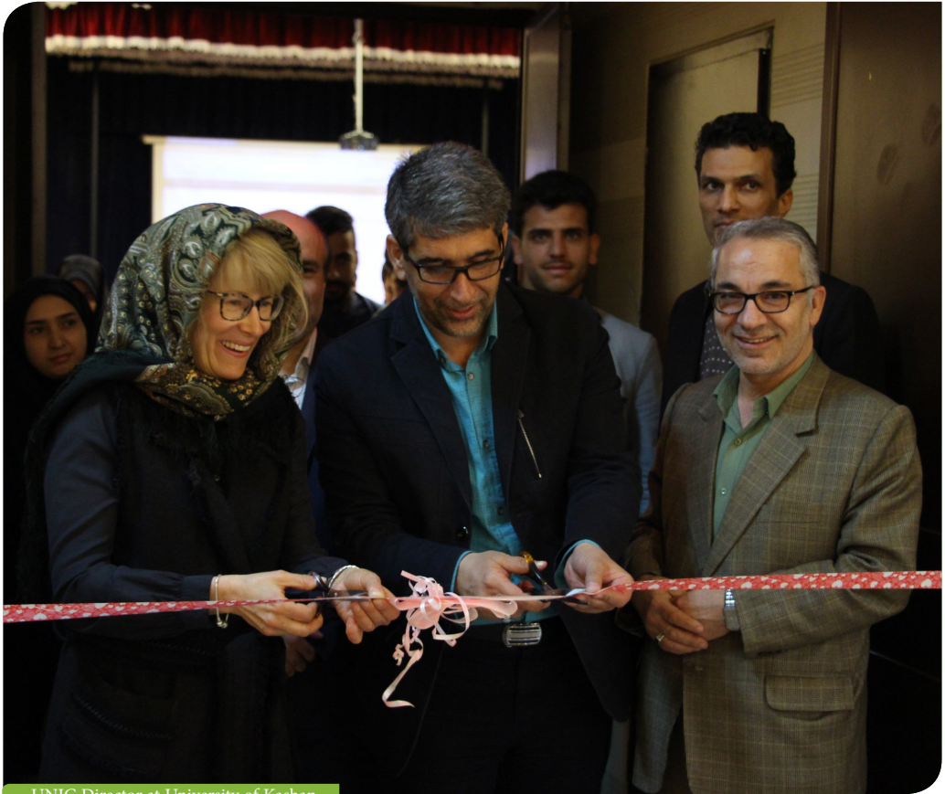
UNIC Director at University of Kashan