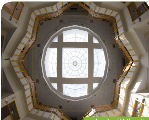
Faculty of Mathematics, Physics and Chemistry