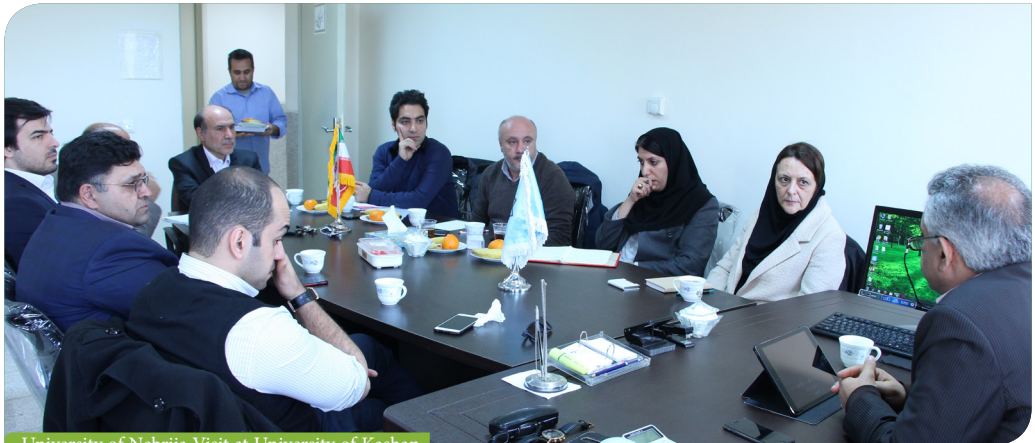
University of Nebrija Visit at University of Kashan