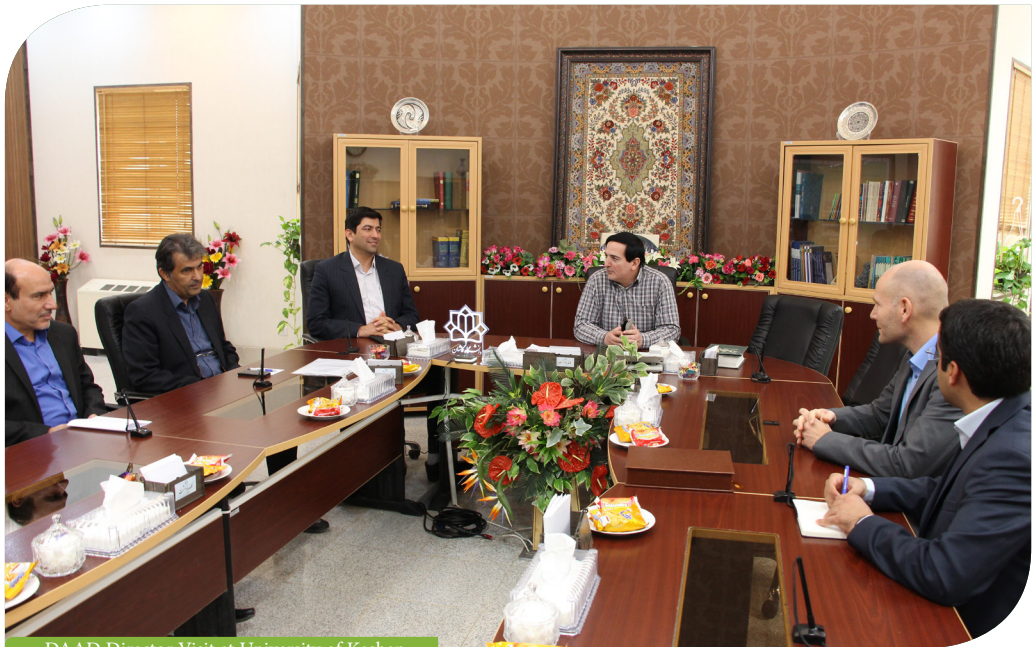
DAAD Director Visit at University of Kashan