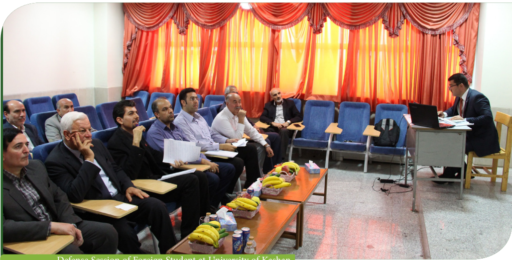
Defense Session of Foreign Student at University of Kashan