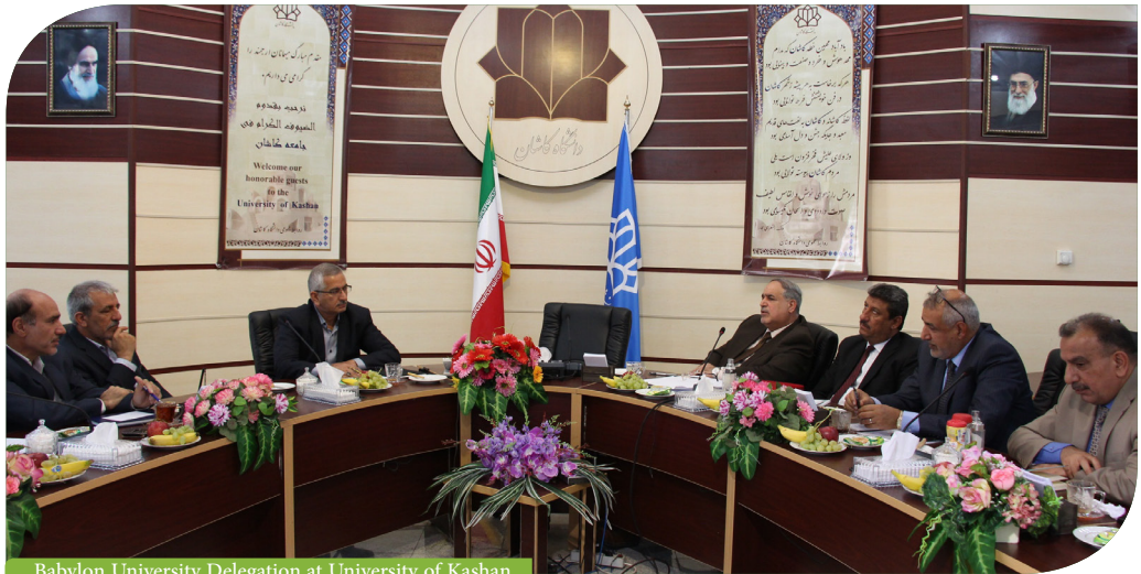
Babylon University Delegation at University of Kashan