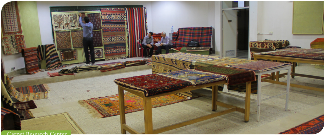
Carpet Research Center