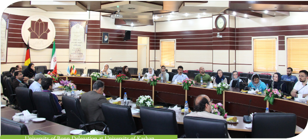
University of Bonn Delegation at University of Kashan