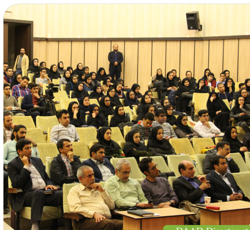
DAAD Director at University of Kashan