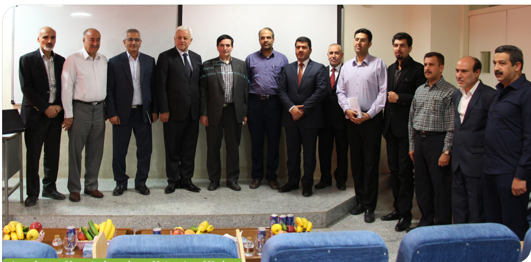
Attendance of Iraq Ambassador at University of Kashan