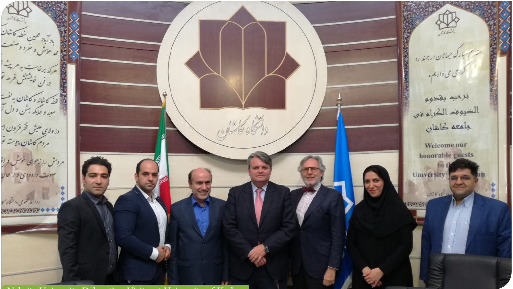
Nebrija University Delegation Visits at University of Kashan