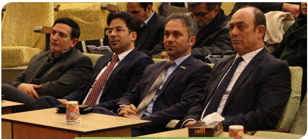
International Conference on Architecture and Mathematics