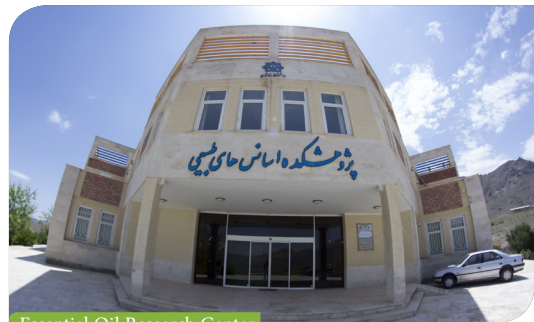
Essential Oil Research Center