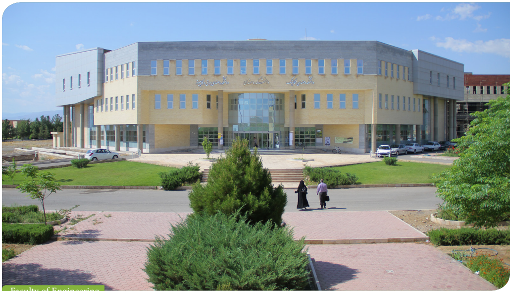
Faculty of Engineering