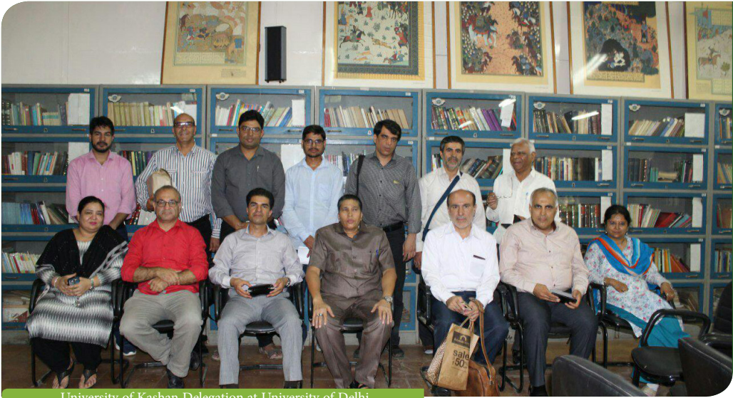
University of Kashan Delegation at University of Delhi