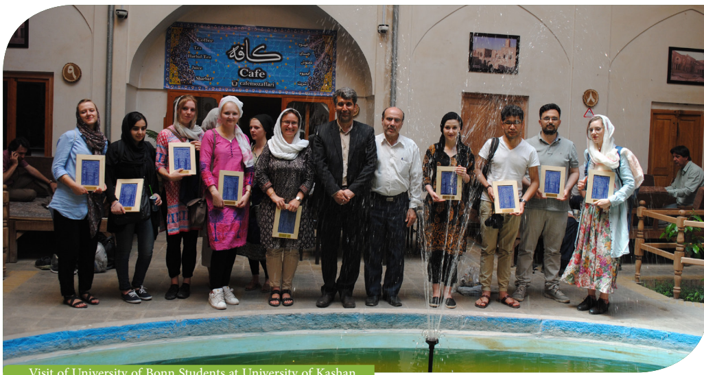
Visit of University of Bonn Students at University of Kashan