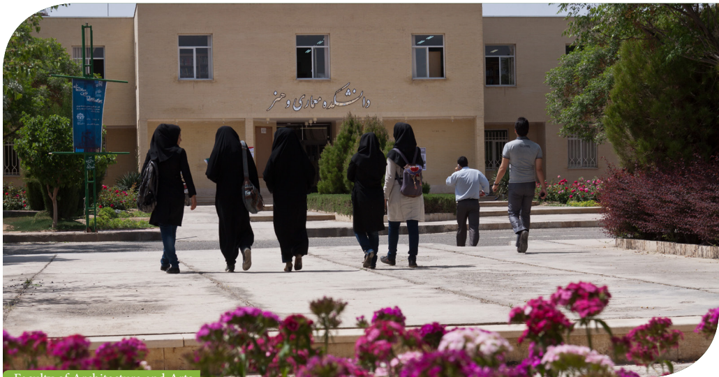
Faculty of Architecture and Arts