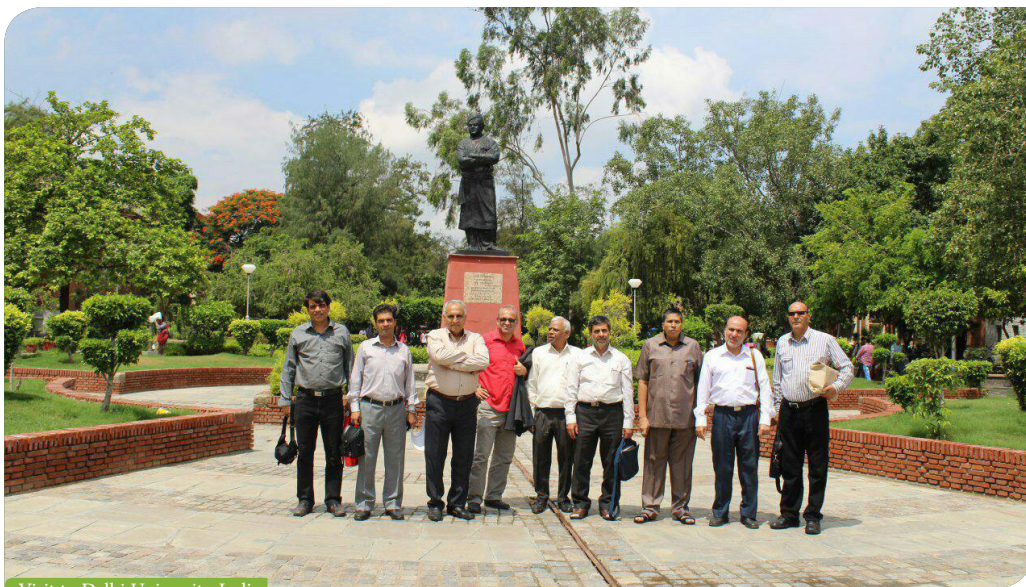
Visit to Delhi University-India