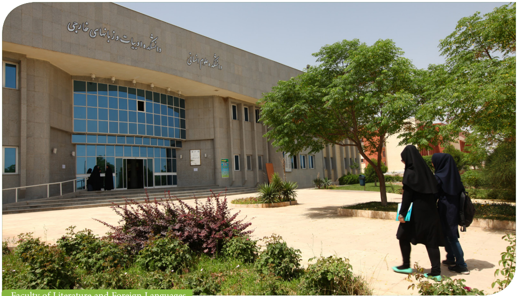
Faculty of Literature and Foreign Languages